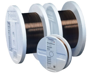
Polymicro Technologies™ Polyimide Coated Capillary Tubing

Boost design efficiency. Provide small production values at reasonable costs. Ensure prototype methodology is directly scalable to high volume with minimal design costs